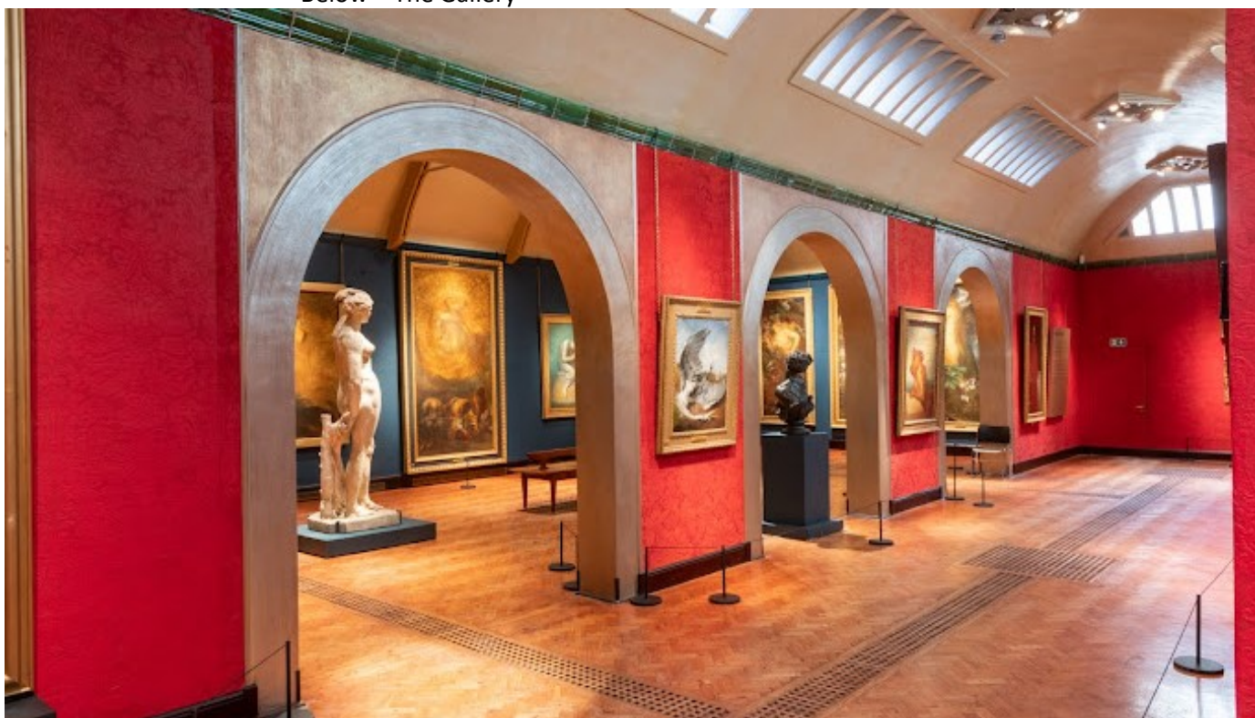
Below – The Gallery