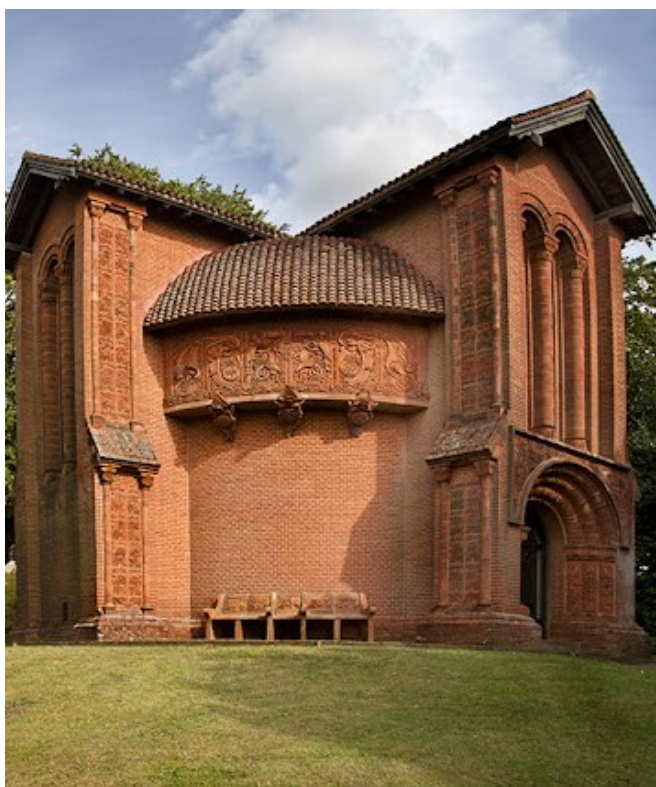
Above left – The Chapel