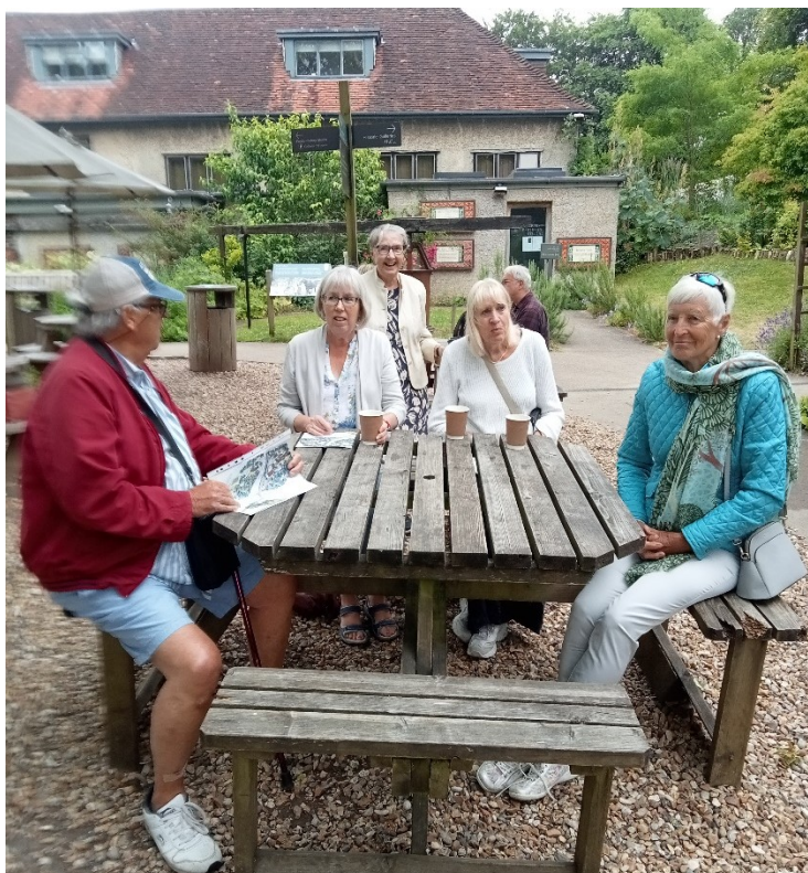
Above right – the group enjoying coffee