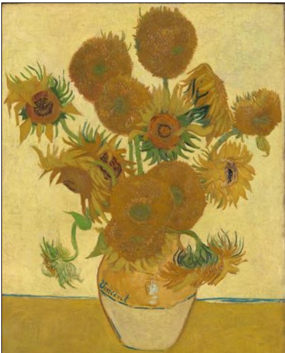
Left below: Vincent van Gogh, 'Sunflowers', 1888